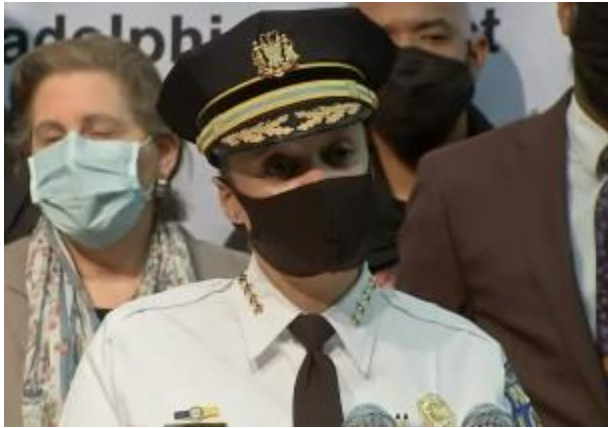
The Police Chief

changing. Shining a light that will bring a new day — peace, trust, healing. Open process that will help us heal.