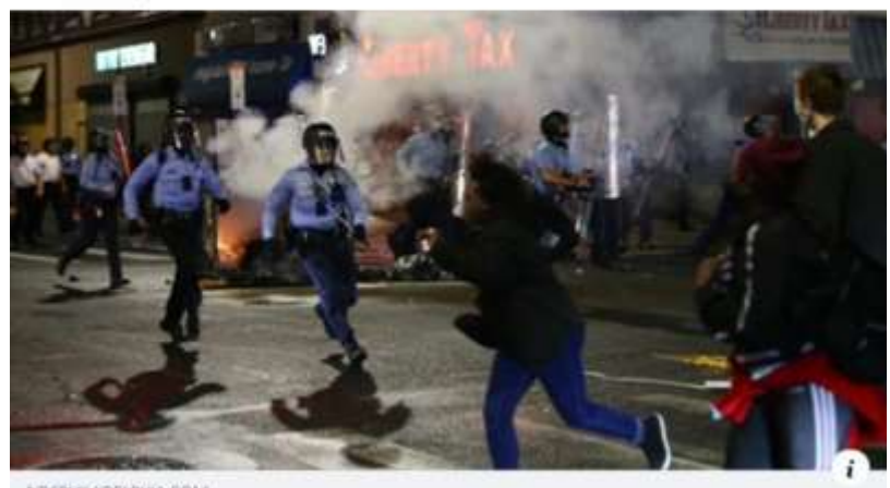
Violence Tears Through West Philly After Police Shoot, Kill Man; 30 Officers Hurt Officials are responding to reports of rioting, vandalism and looting in West Philadelphia folio.

How do we, as a society, make it clear to everyone that when an officer tells you to drop your weapon, you should comply? EITHER we are going to insist that everyone comply with the lawful orders of police officers OR we are going to have unending anarchy, rioting, looting, arson and death. The November 3rd Election is a referendum on what kind of America you want to live in.