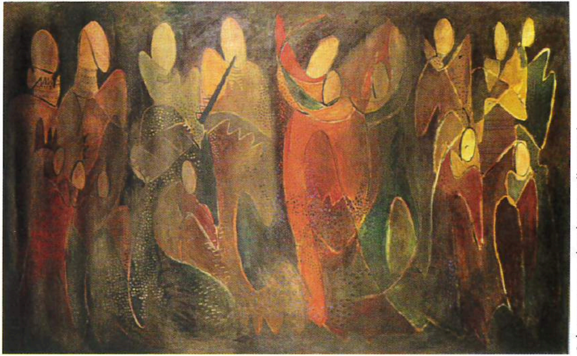
Salma Arastu, The Bliss at Fall Festival