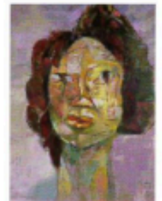
GINI ILICK Portrait Oil on Canvas