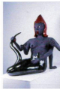
SCOTT ATIYEH Siren (shown) Clay and Glaze, 1999