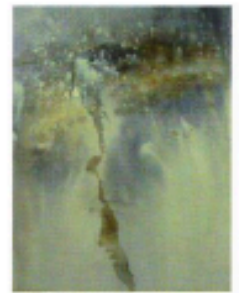
AVE CASSELL BARR Canyon Snow (shown) Watercolor and Gesso, 1999