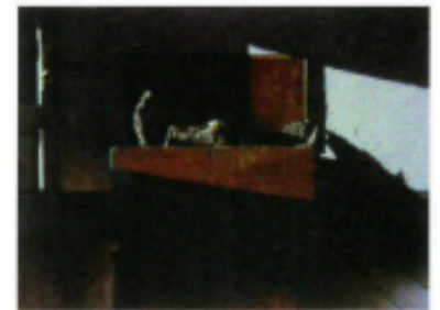
DOUGLAS WILTRAUT Well Seasoned Egg Tempera