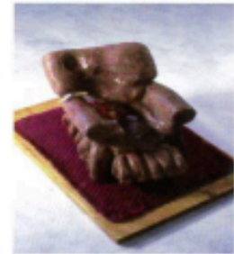
SUSAN SMALL STUDIO 250 Too Much of A Good Thing (shown) Mixed Media, 1999