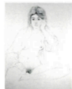
BEN MARCUNE Nude #1 (shown) Line Drawing, 1997