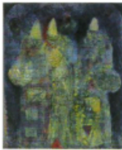
SALMA ARASTU Tribal Trio (shown) Acrylics on Board, 1999