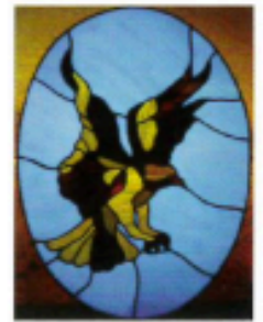
LINNY FOWLER/OCTAVIO PEÑA Eagle (shown) Stained Glass, 1992