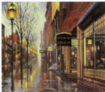
SERGEI YARALOV Moravian Book Shop (shown) Oil