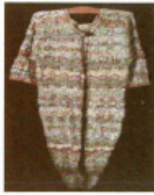
CLAIRE MARCUS Angel Wing Coat (shown) Mixed Fibers, 1997