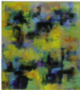
KATIE BEHLER Spring (shown) Acrylic, 1999