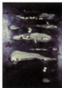
JENNIFER JOH Untitled Mixed Media, 1999