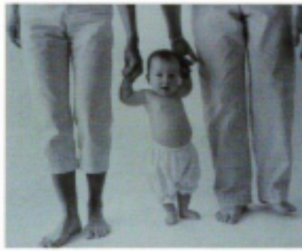
SUSAN POLLACK natalie Silver Gelatin Print, 1999