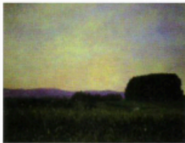
ANGIE SNYDER September Twilight Oil on Canvas, 1999