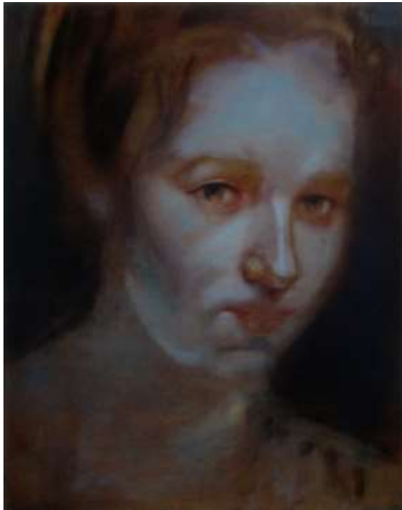
Where the Bones of us Hunger for Nothing