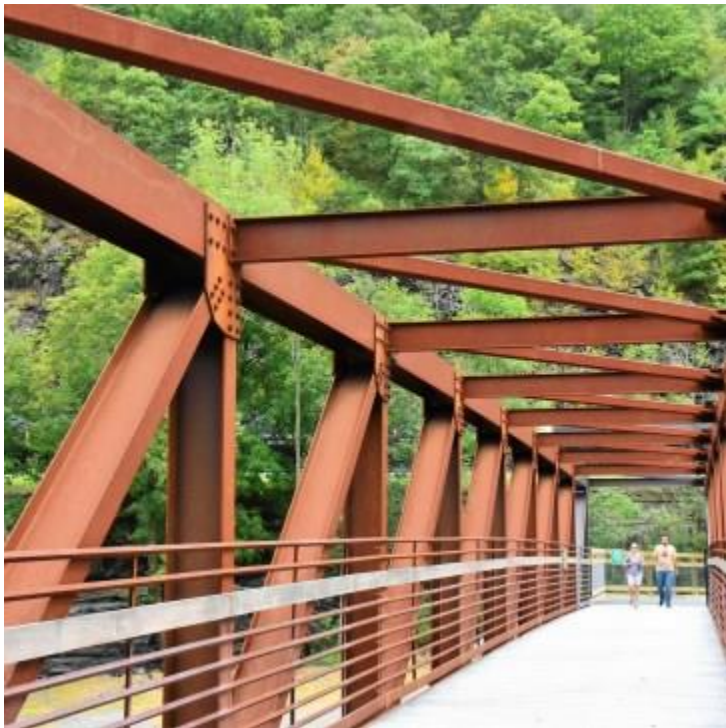
Mansion Bridge, Jim Thorpe