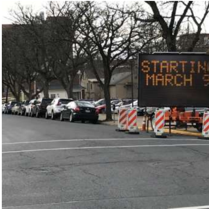
Packer between Vine and Webster closed March 9 for 45 days