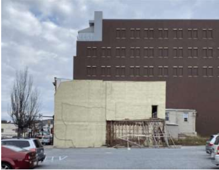
The Bethlehem Gadfly