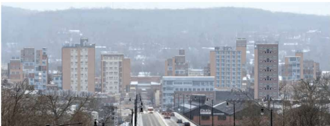
This photo-illustration is an artist's concept of South Bethlehem as it might appear in 2035.