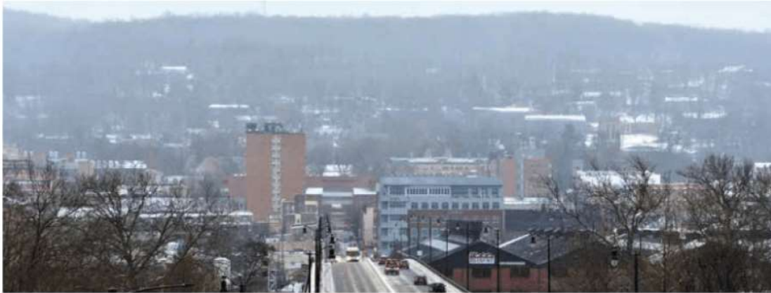
The 14-story Rooney Building dominates the South Bethlehem Business District against the backdrop of South Mountain. December 2020.