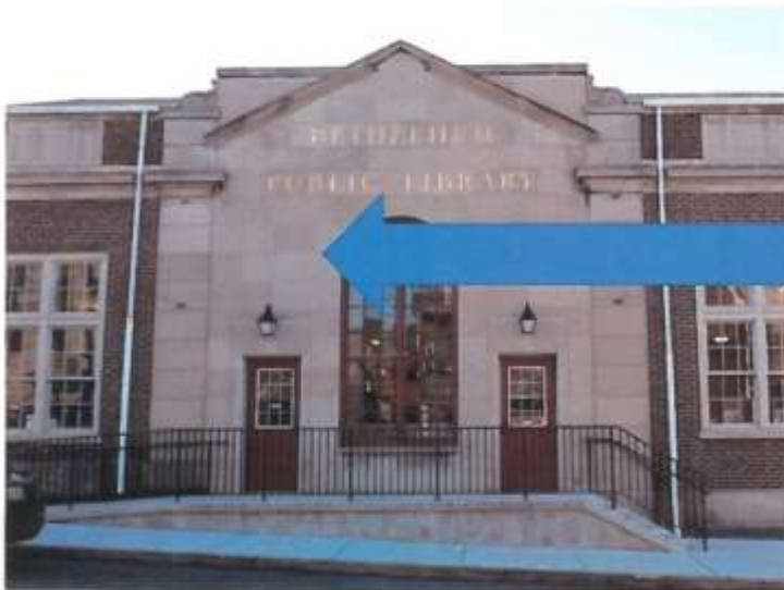
South Bethlehem Library 400 Webster Street

Gadfly really likes this idea. How about you?