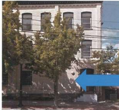
Tally Ho 205 W. 4th Street Mural would be on Brodhead side