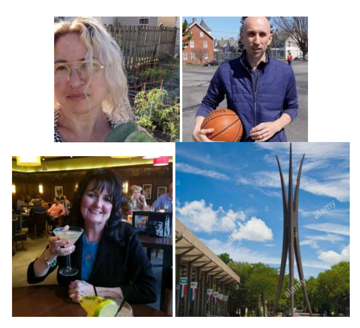
Whew! May 18. This is the day! Long run!

And this, for all intents and purposes, is Gadfly's swan song. (Love the mixed metaphor!)